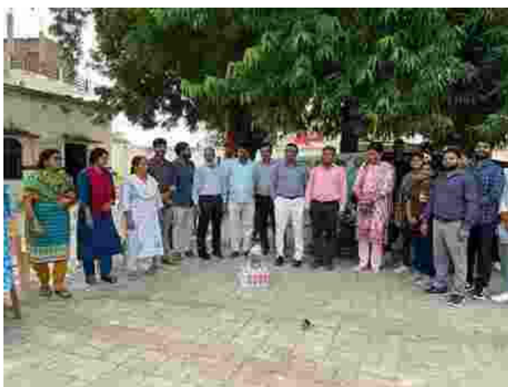
Students, Faculty Members of Physics Department in School with School Staff