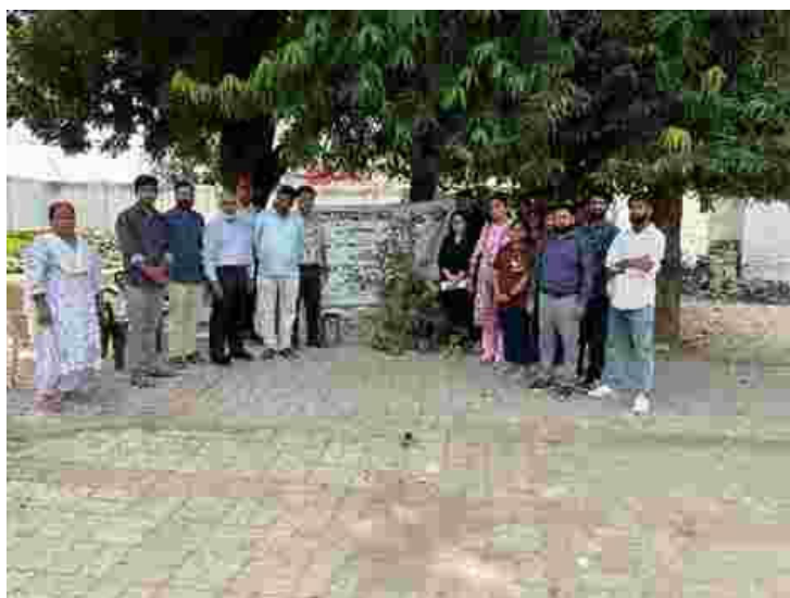
Students and Staff at the Plantation Site