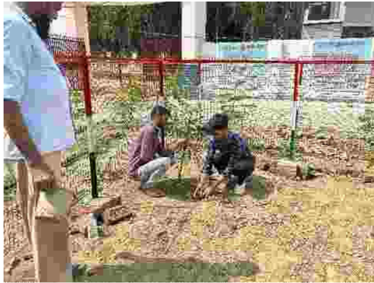
Faculty members giving Directions for Proper Plantation